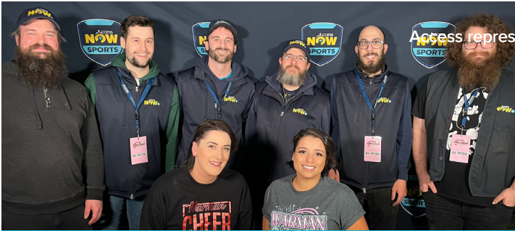
The Access Now crew is cheerful covering the Warman Classic.

The Warman Cheer Classic, Saskatchewan's largest cheer-leading and dance competition took place March 10-12, and Access provided the three-day live stream for viewers everywhere. The Warman Cheer Classic was held at the Legends Centre sports complex in Warman, and hosted over 200 teams, 3,000 athletes and 5,000 spectators.