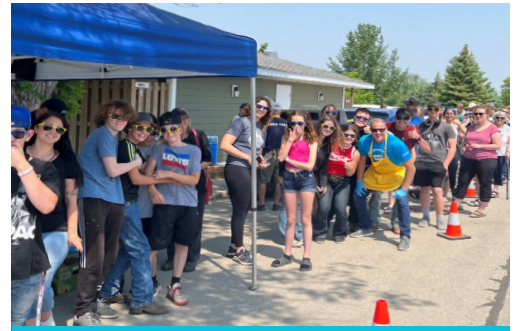
The Town of Wolseley enjoying their BBQ.

This year, we have added new communities to the tour, including Aberdeen, Birch Hills, Bruno, Cochin, Dundurn, Govan, Imperial, Muenster, Nokomis, Raymore, Simpson, Wolseley and Young.