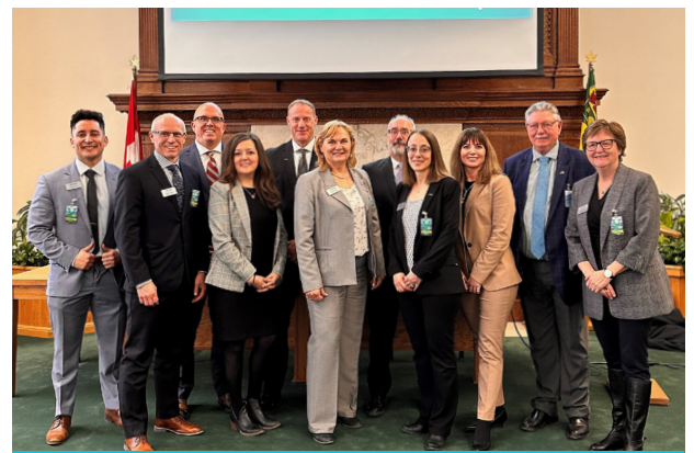
Access representatives at the Legislative Building.

If you're interested in joining the Board of Directors, contact Member Relations (see left).